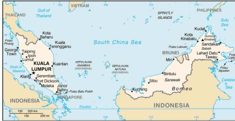
Figure 1: Map of Malaysia (Peninsular Malaysia and East Malaysia).