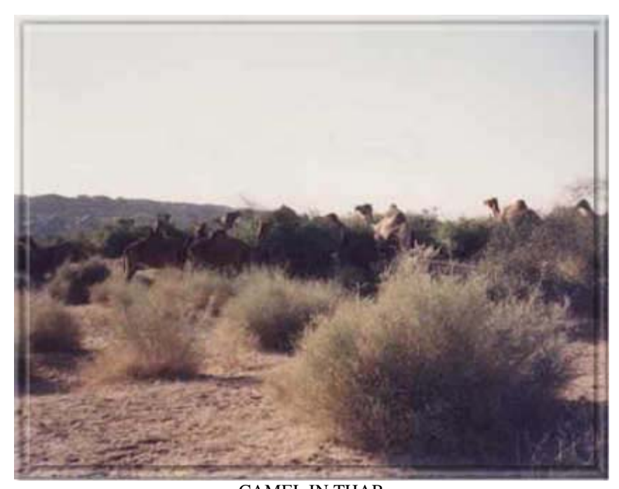
CAMEL IN THAR http://www.tharparkar.sdnpk.org/