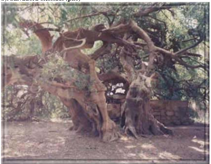
OLD TREE <a href="http://www.tharparkar.sdnpk.or/">http://www.tharparkar.sdnpk.or/</a>

It is a fruit of Khabar tree, which is spread all over Thar. It is not cultivated fruit. There is no ban on collecting of this fruit from private land and government land. This is a fruit like grapes. If its crops are good then it is indication for good rain. People eat this fruit with interest and it is good for health. Livestock also eat this and get fat.