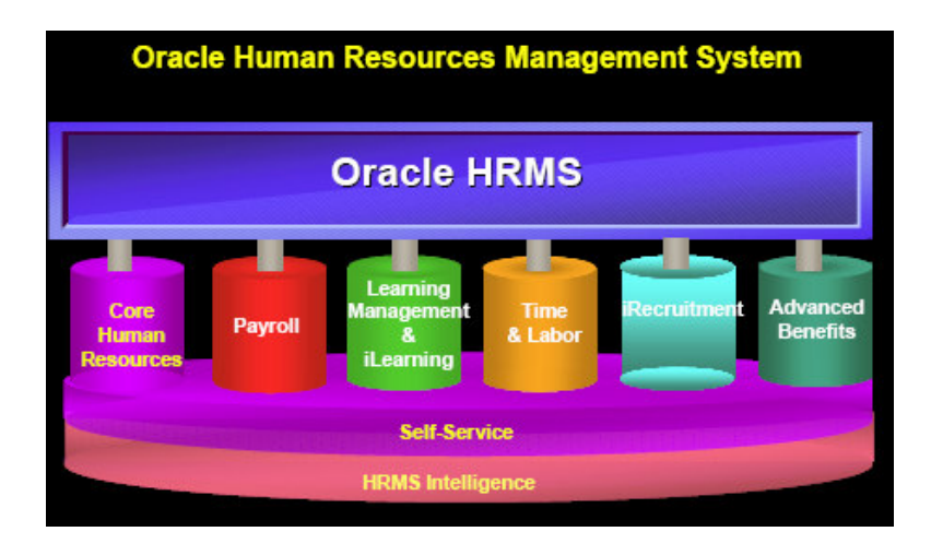
Fig. 1 Suite Human Resources Management System