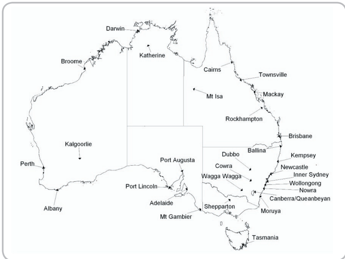
Fig. 2. Location of Indigenous Employment Centres, 2004