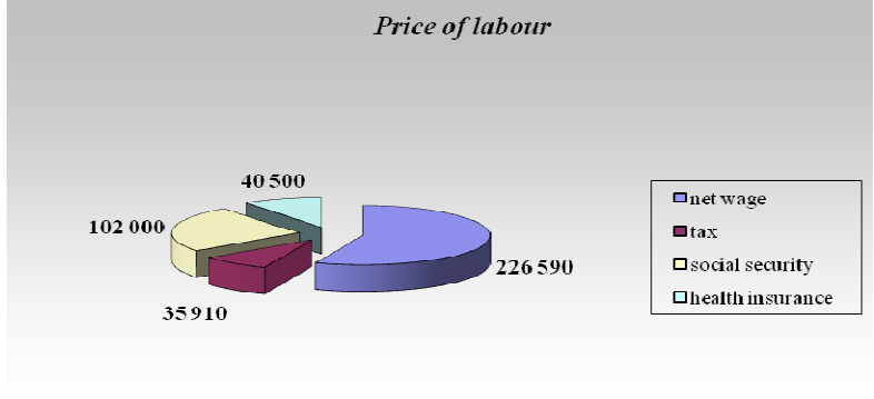
Graph No. 6: Price of labour in 2008 at the income of CZK 300,000<sup>8</sup> Price of labour

The employer shall have to return for this employee another 35 %, i.e. CZK 105,000. Accordingly, the total tax payments in 2008 amount to CZK 178,410. (24 000 + 13 500 +35910 + 105000).