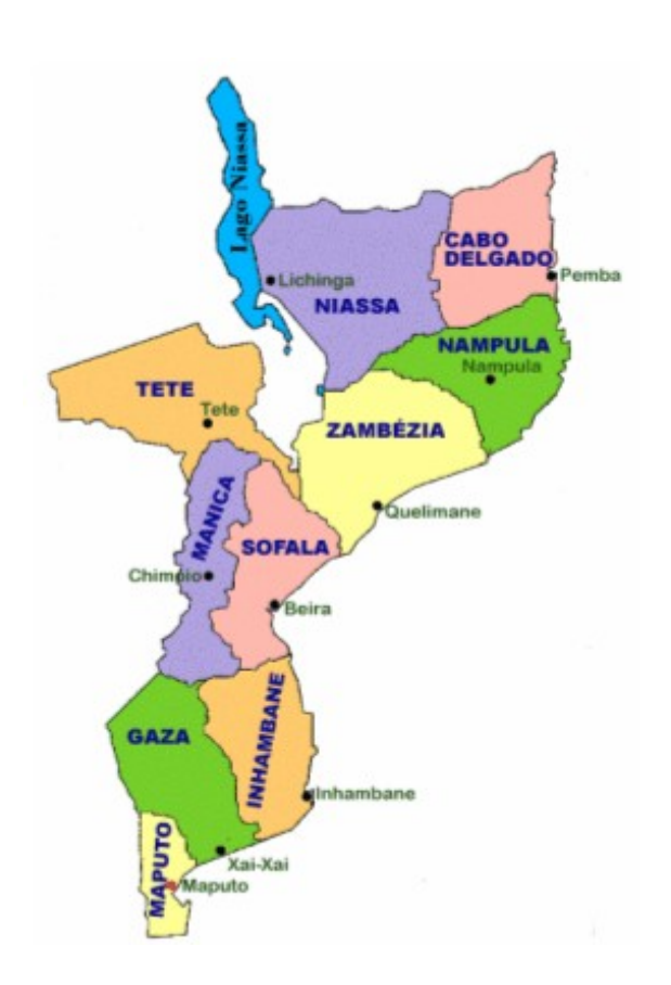
Map of Mozambique