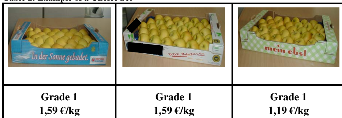
Table 2: Example of a Choice Set

Question: “You see three different offers for apples from different sellers. Which of these apples would you buy at the displayed price?”