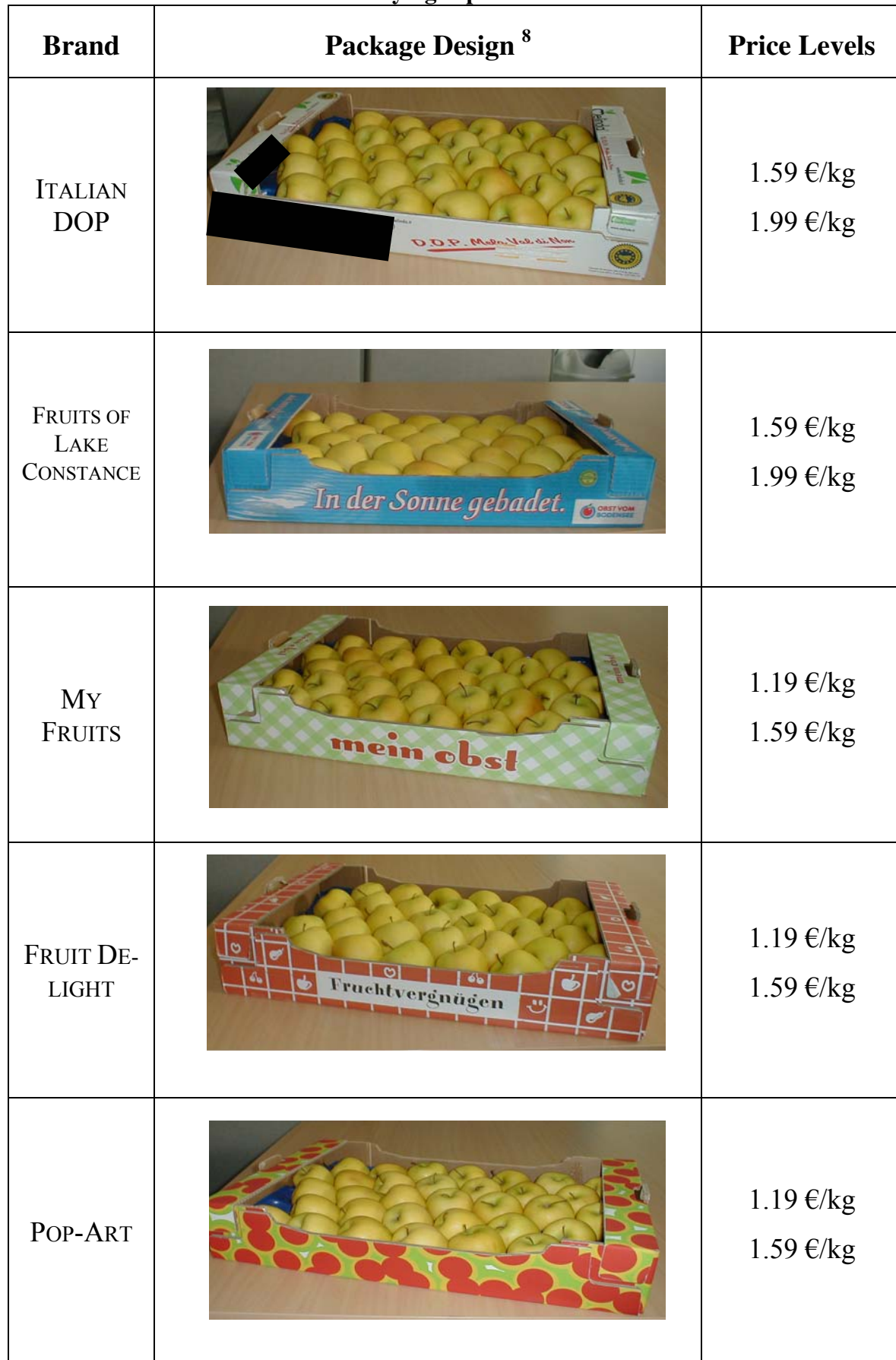
Table 1: Brand alternatives in the buying experiment