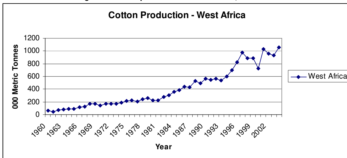
Figure 1: Cotton production in West Africa, 1960-2004