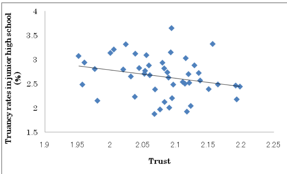
(b) Junior high school