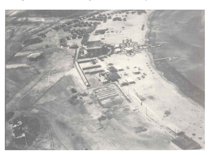
Figure 3. The Bathing Facilities of Glyfada in 1930

After the Second World War, Glyfada enjoyed an equivalent popularity as a tourist resort. The turning point in this trend took place about the middle of the 1980 decade when different factors of negative environmental impact and its accumulative effects on a regional scale contributed to deteriorated the ensemble of Glyfada's natural resources. At the same time, the arising of new tourist destination competitors both on a national and international level determined a spatial redistribution of tourist flows limiting thus Glyfada's competitiveness as a tourist destination.