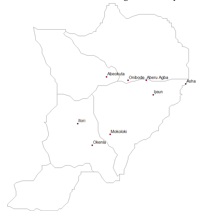
FIGURE 3. Punch's Tour of Egba Country, 1902

This period of land scarcity altered Egba farming practices as Boserup's theory predicts. Evidence for this claim comes from Cyril Punch's 1902 tour of the Egba country. 45 Some of the sites he visited are depicted in Figure 3. Three differences were still apparent between the land-scarce region of initial settlement and those areas occupied later on. First, farmers near Abeokuta shortened their periods of fallow. Between Abeokuta and Aberu Agba, Punch reported fallow lengths of 3-4 years, 5-6 years, and 4 years. Between Ijeun and Ashero (northeast of Mokoloki), he reported three times that land was left fallow for 5-6 years. Second, Egba cultivators used intercropping more intensively on the exhausted soils nearer Abeokuta. Third, farmers abandoned the long fallows that allowed the land to return to forest. Punch mentions indefinite or very long fallow periods between Kajola (East of Onibode) and Aberu Agba, Ijeun and Asha, Asha and Ilogbo, Coker's farm and Ashero, and between Okenla and Itori. None of these are in the first stretch from Abeokuta to Onibode, and only one is in the directly southern region where the Egba made their first military expansions. He encountered little forest before Ijeun and between Okenla and Itori. 46 Punch himself believed that the Egba were expanding into "a belt adjoining the forest and this belt is gradually encroaching on the forest and is itself being encroached on by second rate [fallow] land."