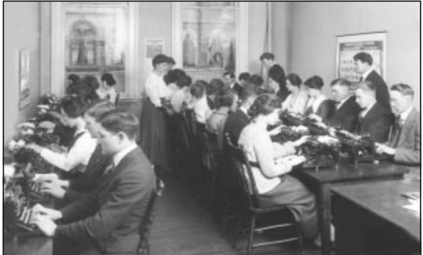
Typing class, London, Ontario

Adapted from Employee Training: An International Perspective, published by Statistics Canada (Catalogue no. 89-552-MPE, no. 2). Constantine Kapsalis is with Data Probe Economic Consulting Inc. He can be reached at (613) 726-6597, or kapsalis@magi.com.