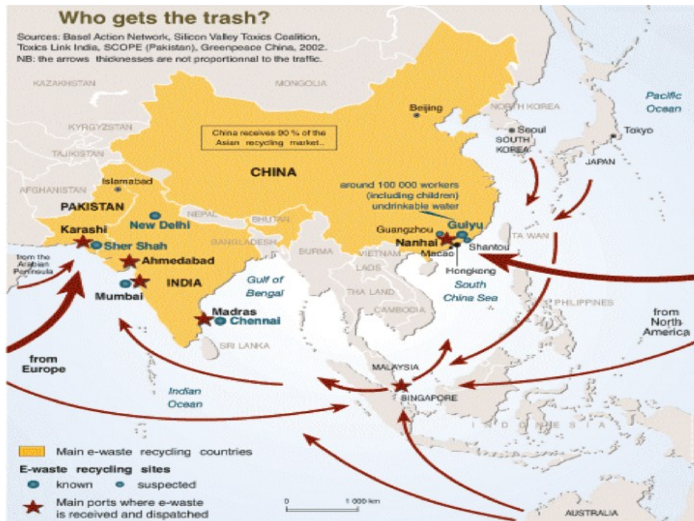
Figure 1 The routes of e-waste in Asia

Figure 1 is used to indicate main e-waste flows in Asia; however, no reliable data and figures available on how these transboundary e-waste routes are because currently the illegal and unregulated sector dominates the recycling industry in the industrializing countries (Widmer et al., 2005). As such, there are many obstacles revealed in safely and effectively processing electronic disposals.