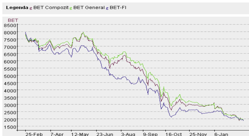
Figure 2 – The evolution of the most important stock market index of the Romanian stock market

During the crisis, nothing affects the economy more than panic. The emergence of a rumor or a fear of instability of the financial institutions triggered an avalanche that can not only crush the institutions, but the whole system. Hysteria covered the Romanian financial market, the signal being the collapse of the stock exchange, although the size of the disaster is not only justified by the international crisis. They followed the depreciation of the exchange rate and the adoption of a prudent loan policy of banks.