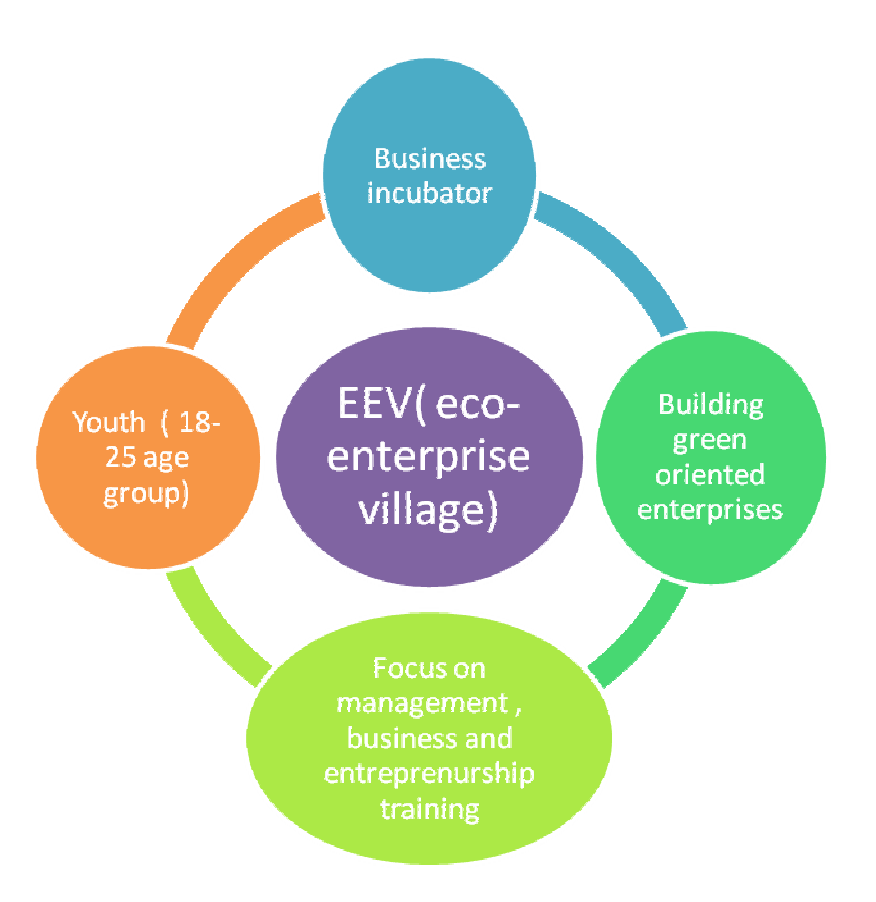
Figure 1 Eco-Enterprise Village features

P. Koshy : "Role & Relevance of BIs in ICT led global educational system: case for Eco-Enterprise Village"