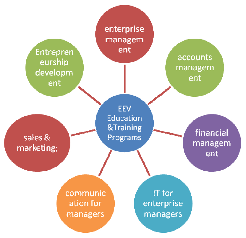
Figure 2 EEV Education & Training Programs

Offering practical and applied education and training programmes for the youth and any other desirous entrepreneurs as well as anybody else would be a major part of EEV - BI programmes. A list of probable courses that would be offered include: Entrepreneurship development; enterprise management; financial management; accounts management; sales & marketing; communication for managers; and IT for enterprise managers.