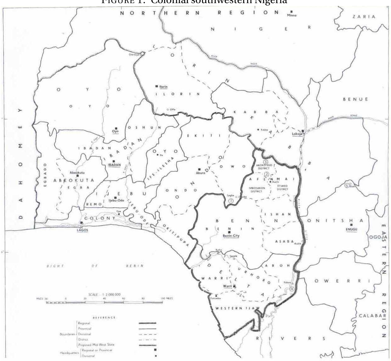
FIGURE 1. Colonial southwestern Nigeria