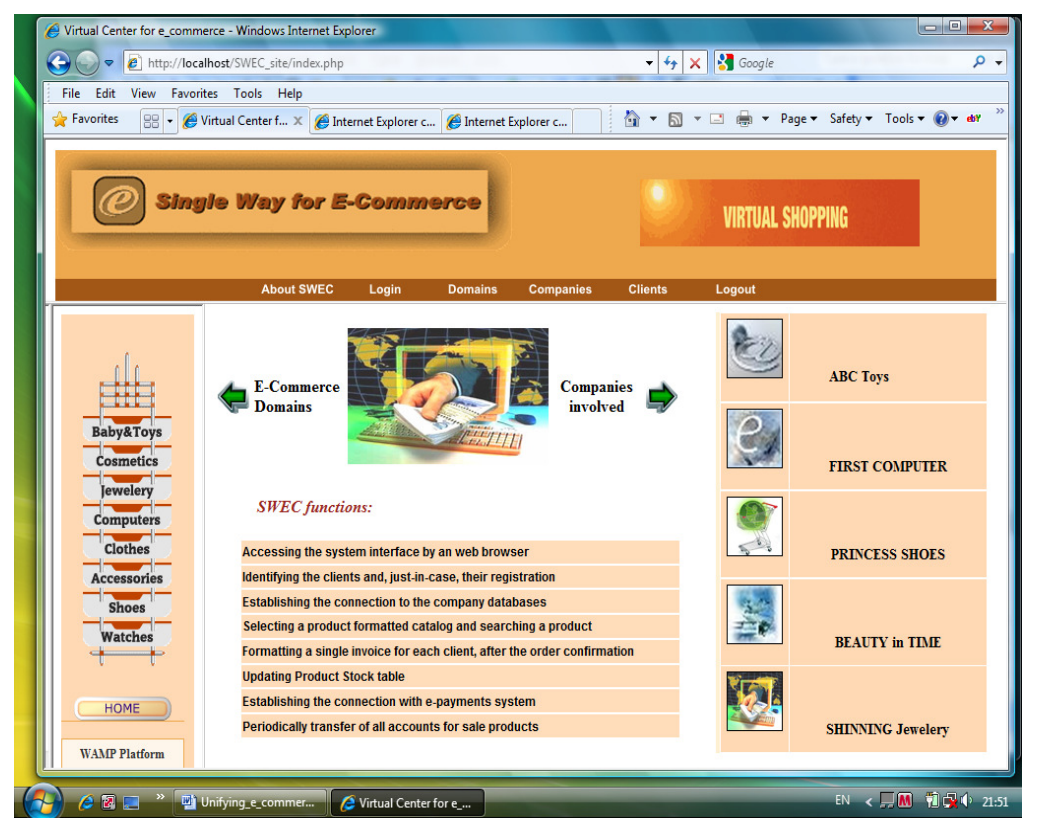
Figure 4: The main graphical user interface of the website

SWEC system has a friendly and suggestive interface using menus with explained options that simplify the selection of the next branch (figure 4 - the main graphical user interface of the website).