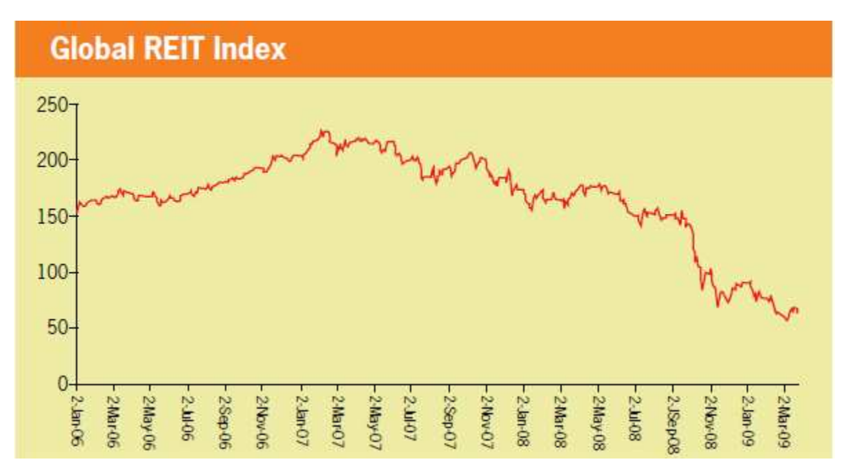
Source: Global Business Monitor International, Eurekahedge, Zawya, Ernst & Young analysis

Each Islamic REIT must have a Shariah board responsible for ensuring that the Islamic REIT complies with Shariah principles. According to the Securities Commission Al'-Aqar KPJ healthcare REIT was the first Islamic healthcare REIT listed on Bursa Malaysia Securities in August 2006. The second was an Islamic plantation REIT called Al-Hadharah Boustead REIT.