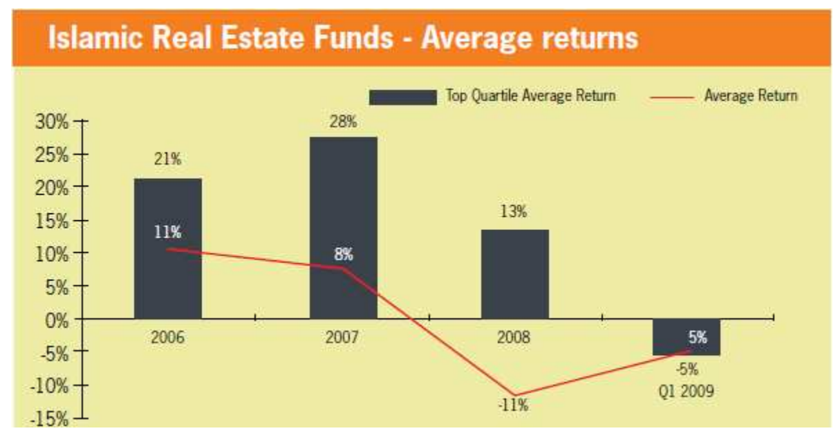
Source: Ernst & Young Islamic Funds & Investments Report (IFIR 2009) Note: Data includes returns of 17 funds

minus 5 per cent in the first quarter of 2009. It is clear that these funds have been badly affected by the downturn in real estate asset prices.