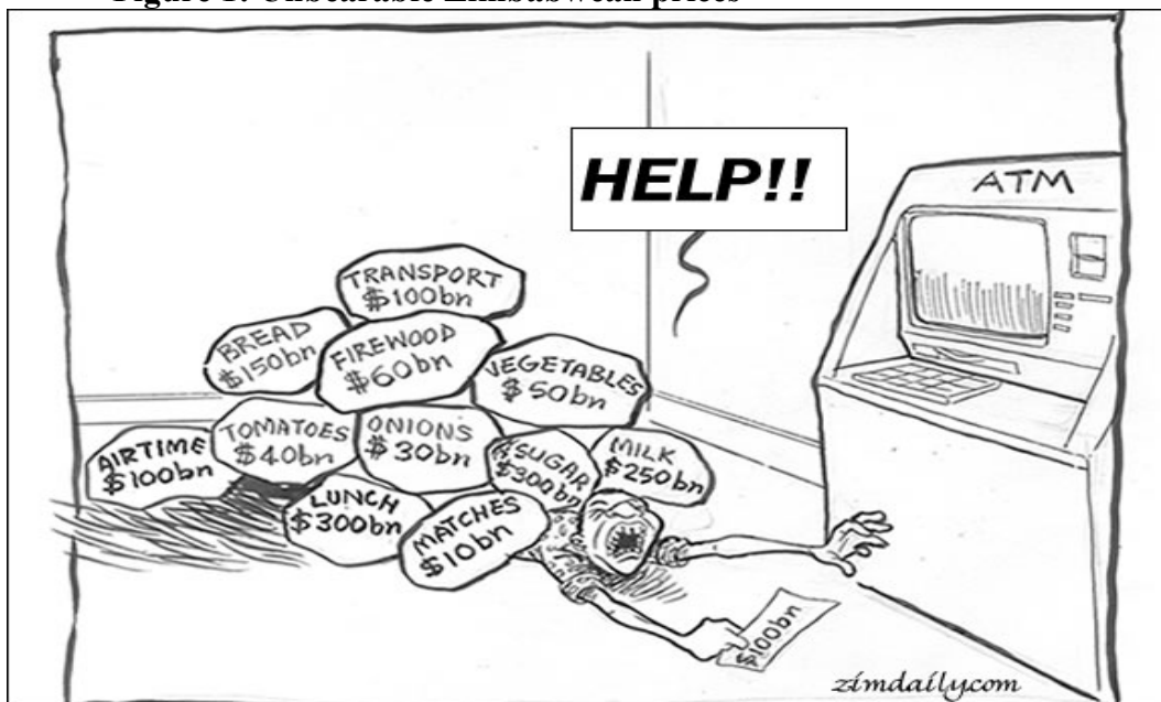
Figure 1: Unbearable Zimbabwean prices