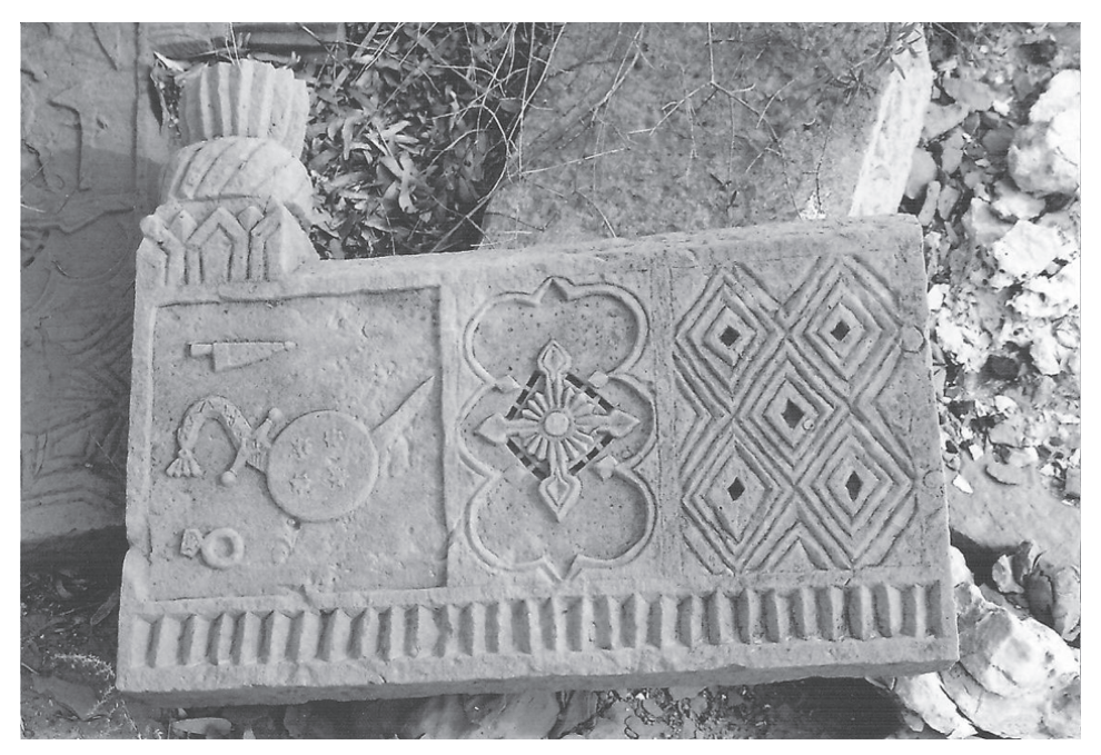
Figure 3. A dislodged gravestone showing a finger ring weapons