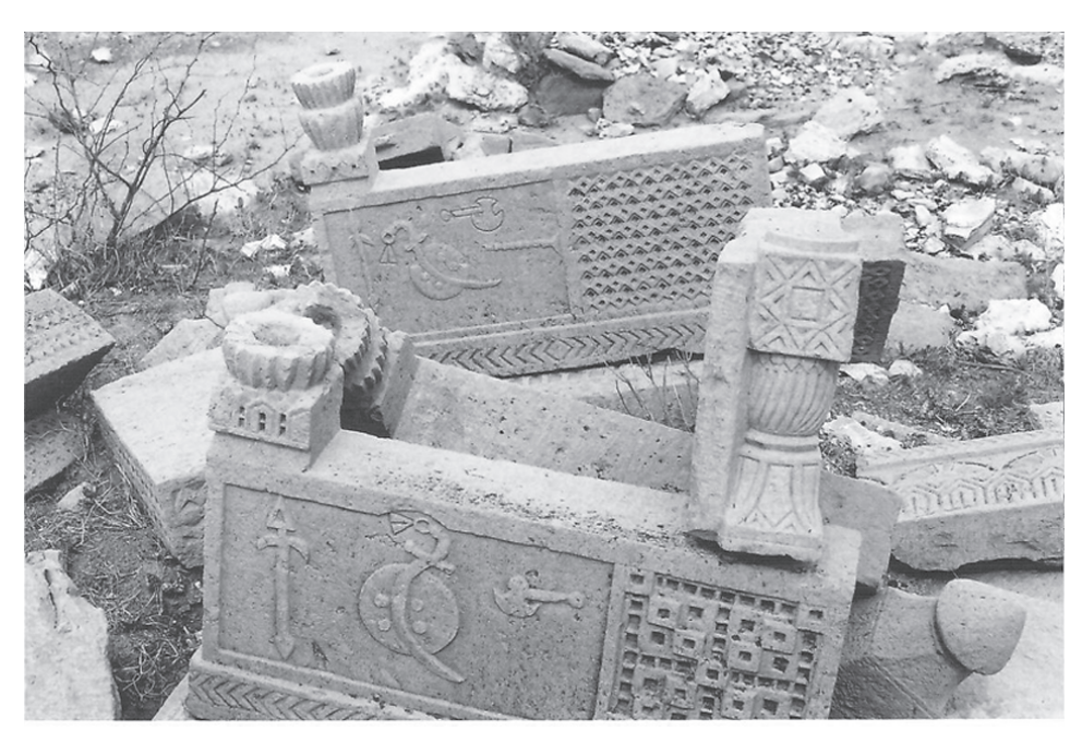
Figure 2. Weaponry depictions on chaukhandi tombs in the necropolis at Oongar