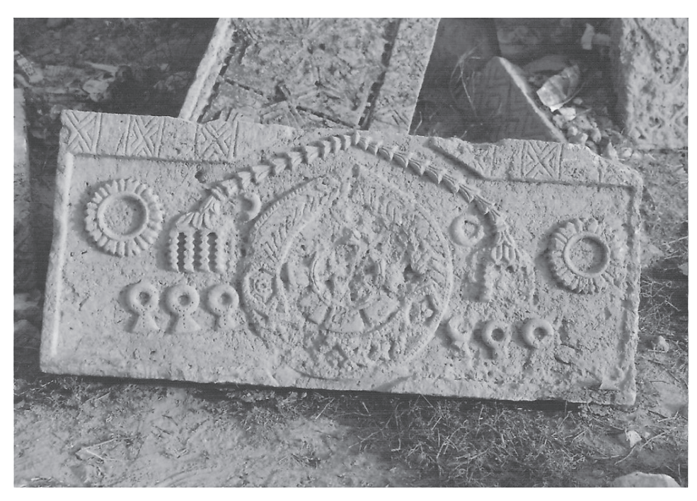
Figure 6. A panel showing various items of jewellery in the necropolis of the Jats

tombs bear weaponry depictions, evidence of the deaths in the battle of Siri of most of those interred there. When tombstones and canopies were erected by their descendents, the motifs of weapons bore testimony to the fact that they were valiant and patriotic warriors who sacrificed their lives while defending their mother land. The jewellery depictions on women's chaukhandis are commonly found in the necropolis of the Jats whereas at Oongar there are only two graves bearing jewellery depictions. One finds inscriptional slabs lying all over the site at the cemetery of the Jats but it is difficult to find any inscriptions at all at the Oongar necropolis since all of the chaukhandis have disintegrated and not a single tombstone is in its original condition.