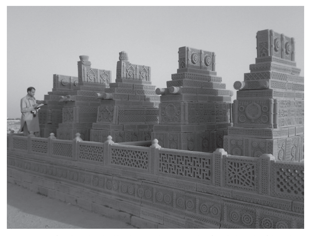
Figure 1. View of tombs at the Chaukhandi necropolis near Karachi, after which tombs of this style may be named