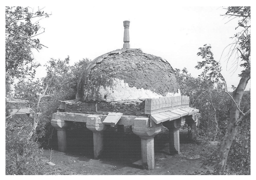
Figure 4. So-called canopy of Darya Khan Burfat