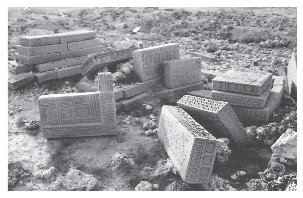
Figure 5. Dilapidated chaukhandi tombs in the necropolis of the Jats

There are more than six chaukhandi tombs which depict jewellery and therefore belong to women. It was the custom among the tribes to bury their men and women in the same necropolis; women were given space near their deceased husbands or sons. There is a variety of jewellery chiselled into the dislodged slabs scattered through the necropolis; for instance, the centre of the panel in Figure 6 is occupied by a necklace. Above this there is the sanghar patti (head ornament with pendants) mostly worn by Jat women; two nose rings are depicted close to the pendants of the sanghar patti and two pairs of bracelets on each side of it; three finger rings appear on each side of the necklace.