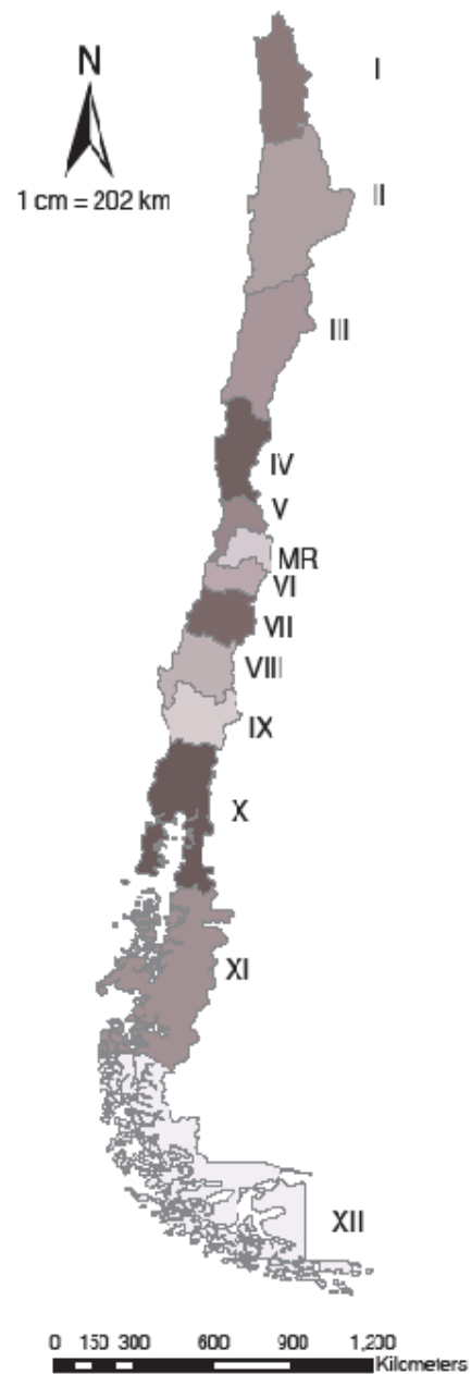
Figure 1: Map of Chile

Finally, with the estimated AIDS parameters, the expenditure function for the average individual in every commune on housing characteristics was recovered with the estimated AIDS parameters in order to construct the SHPI.