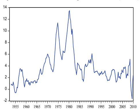
Figure 1. CPI-Based Inflation Rate, Percentages, Year-on-Year, 1953Q1 to 2010Q1