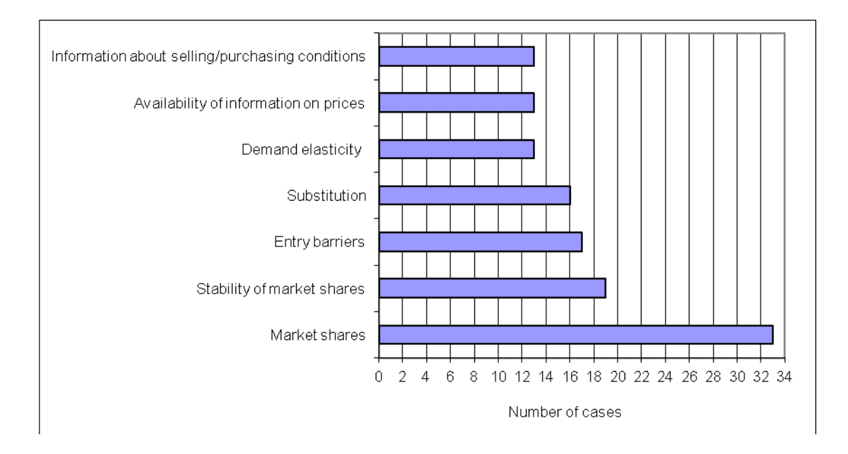
Chart 1. Number of Cases that Include Certain Indicators of Collective Dominance

The number of times each of these factors is cited in our cases is presented in chart 1.