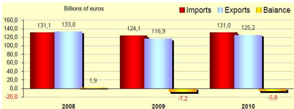
Figure 2: Trade in commercial services (Services excluding “Government Services”) EU 27 with US (billions of euros)

Next we present an analysis of trade in services between E.U. and U.S. in the period 2008 – 2010.