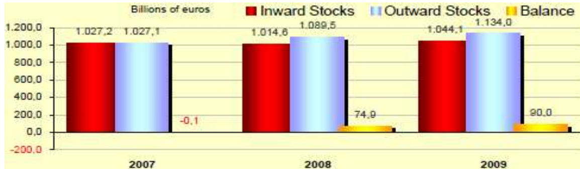
Figure 3. Foreign Direct Investment - EU 27 Stocks of FDI with US (billions of euros)

lower than in 2007. For EU27 U.S. is the largest source of investment, but the trend is downward. If in 2009 they amounted to €97 billion in 2010 reached €28 billion 4 .