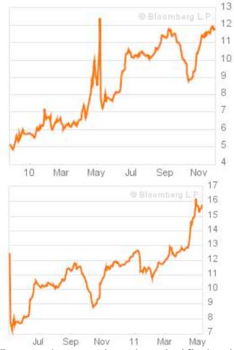
Fig. 3 Yield of Greek 10Y bonds 2010-11 (Bloomberg)

On the contrary, aggressive operators with risk loving attitude populate the secondary market (hedge funds, investments banks and others); they do not enjoy the direct effects of central banks liquidity. Higher spreads of the secondary markets reflect not only the effective risk of certain debtors (like Greece), but also the high speed of adjustment of risk-lover operators, fuelling further volatility. The pricing mechanism is not working properly, and the fundamental condition of absence of arbitrage cannot be verified.