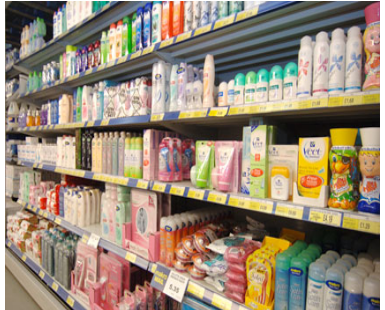
Figure 1: FMCG Toiletries Products with Companies' Names

Fast Moving Consumer Goods are products that are sold quickly and at relatively low cost. Examples include non-durable goods such as soft drinks, toiletries, and grocery items. Pakistani market has many products which its offers in FMCG category.