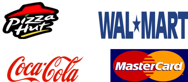
Figure 2: Brand Symbols depicting clear product categories with respective Brand Names