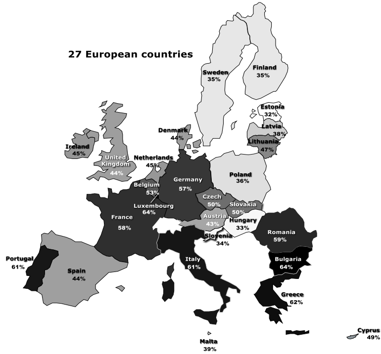
Figure 1. Percentage of fairly worried or very worried individuals about the misuse of personal data