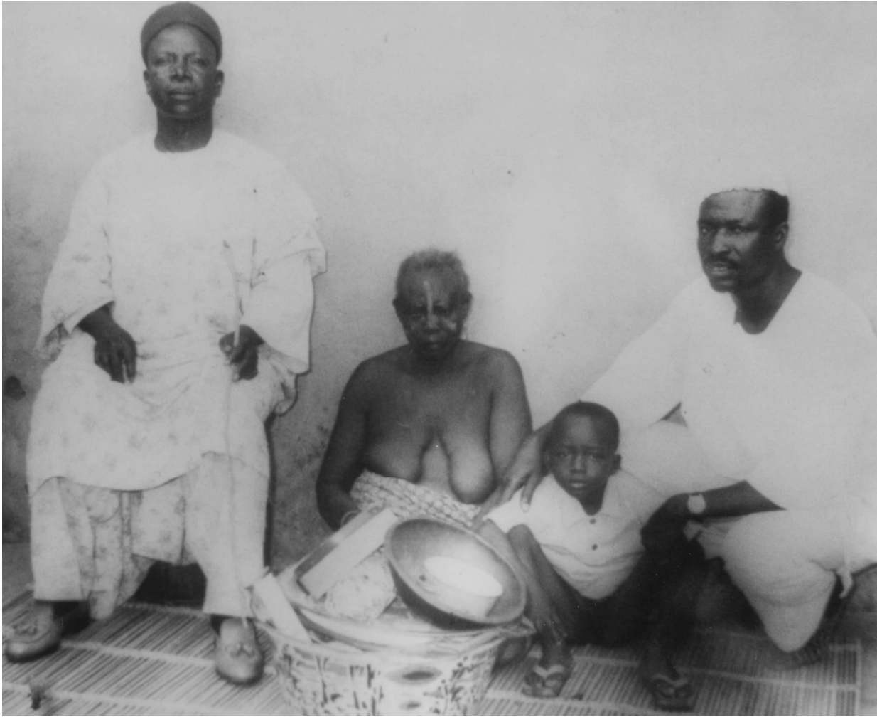
Fig. 5: A convicted 'witch' - One of the three framed photographs of detected 'witches' displayed, together with a diploma, certifying that the owner was a recognised witch-doctor, on the wall of the compound of a boci in Mokwa in 1982.

was accused of having bewitched her son and husband „to give his mother money“, i.e. to guarantee the social security of his mother. In another case a small schoolboy fell seriously ill. He was allegedly bewitched by a barren older woman living in the same compound, said to be jealous of the fertility of her female co-residents. In both cases, the accused women „confessed“ their evil deeds and loosened their spell, i.e. their „victims“ recovered from their illness. 85 Whether these confessions were made without coercion is doubtful, last but not least, because my informants in Mokwa agreed that if an accused person tried to argue, he or she would be forced to prove his or her innocence by an ordeal, applied either by the ndakógbòyá or a boci . In the Mokwa region the accused was given a certain potion, called fien or tagan , which is meant to cause him to confess im-