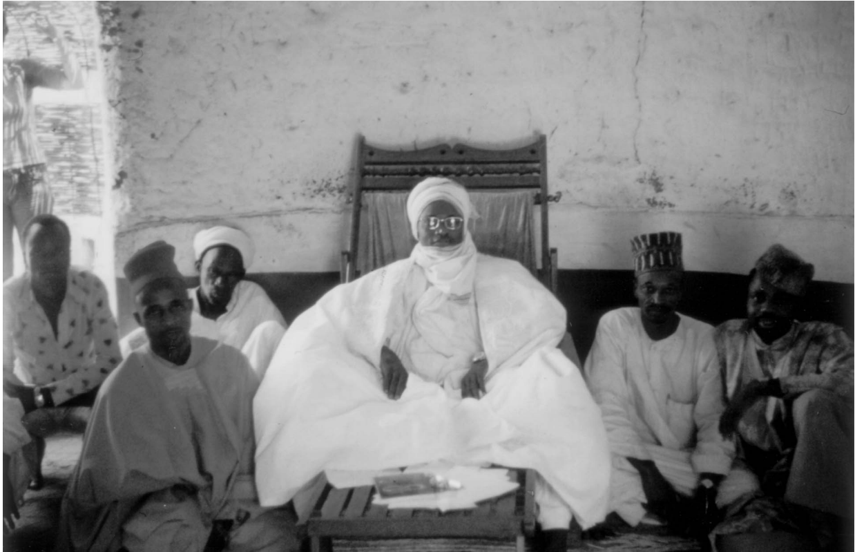
Fig. 4: The local ruler of the ndakógbòyá, the District Head of Jima/Doko, at his home, surrounded by his councillors (in 1976).