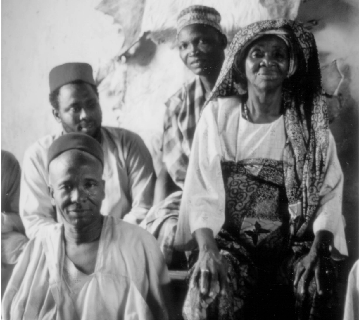
Fig. 1: The The Lelu of Dabba (Trans-Kaduna) with her entourage in 1982.

ballot system“ was still in practice at that time, the above mentioned threat proved to be very effective indeed, because the voters had to queue behind their candidate.