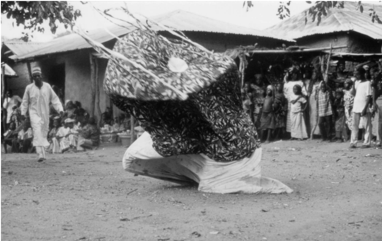
Fig. 3: A performance of the cleansing ritual of the ndakógbòyá -mask at Kusogi in 1982.

(due to reasons to which we shall return later), a considerable number of the lodges of the ndakógbòyá still existing to be at pains to cover the expenses for the ceremonies, dances, and the maintenance of the masks.