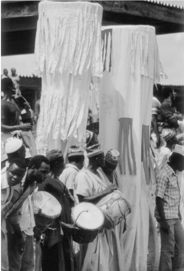
Fig. 2: The ndakógbòyá mask, welcoming the Oba of Benin and the Etsu Nupe on their arrival in Bida 1982; the mask resembles exactly the ndakógbòyá masks already documented and photographed by L. Frobenius in Mokwa in 1909 and S.F. Nadel in 1936.

Although belief in black magic is still ingrained in both members of the ruling class in Bida, the capital of Nupeland, and the peasants in the countryside, this does not mean that there have been no changes since Nadel made his investigations among the Nupe. Probably the most noticeable transformation did take place in the realm of control of the supposed witchcraft activities. The ndakógbòyá , in the 1920s one of the most powerful means in the hands of the Etsu of detecting witches and thereby of exploiting the peasantry, is now also used for entertainment purposes, as a masquerade, a „cultural performance“, which features on occasions of social enjoyment, devoid of its original social and religious meaning. Nowadays, the great masks of Kusogi 59 , for example, are invited to perform their dance at Sallah, at agricultural shows of the Bida Agricultural Development Project (established in the early 1980s), or to „greet“ important state guests who visit the Emir in Bida. Such events, like the performance on the occasion of the recent visit of the Oba (king) of Benin, who toured the northern Emirates in October