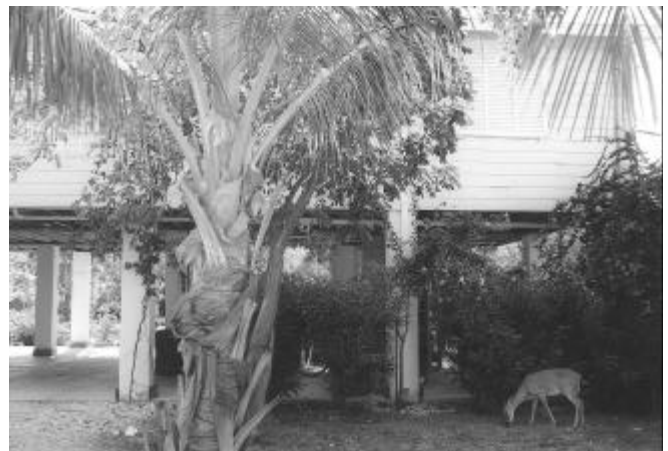
In Austin, Texas, hotels tower over a bridge used by Mexican free-tailed bats ( Tadarida brasiliensis), tourists, and entrepreneurs (above). Although urbanization and economic infrastructure occasionally provide habitat components, most species are displaced in toto, and some of the species benefited can scarcely be classified as "wildlife," as with the endangered Key deer ( Odocoileus virginianus clavium ; bottom).

demand on many of the world's limited natural resources. Human degradation of terrestrial and aquatic communities is biologically inadvisable. Certain of these resources are irreplaceable, and others must be either preserved intact or managed carefully to ensure the integrity of the ecosystem and humanity. These resources will continue to decline or to sustain irreparable damage, despite scientific and technological advances, if the growth of the human population is not restrained." These statements are clearly true, but the mathematical abstraction of human population has no ecological impact of itself; it is the economic activities of the population that impact the ecosystem. As long as economic growth continues, whether via population or per-capita consumption, the ecological benefits of human population stabilization will remain evasive. It makes little sense to have a position statement on population growth without a complementary statement on economic growth.