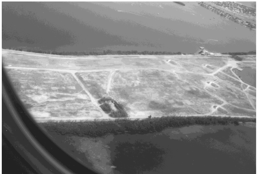
Habitat liquidation is a prerequisite of economic growth, consistent with the principle of competitive exclusion. In the Florida Keys, mining, agriculture, and subdivision development are often found in close proximity.

This does not imply that privately funded habitat acquisition is bad for conservation, especially relative to other expenditures. It implies, however, that habitat will become unavailable for acquisition as habitat is liquidated to generate funding. The unlikely alternative is a perpetually growing economy on a perpetually diminishing productive land base, as habitat is acquired for conservation and thus taken practically out of economic production. If the latter alternative is not possible (as ecological economics asserts), then a steady state economy with a stable ratio of conserved habitat to economically productive land is a minimum requirement for wildlife conservation. In other words, negative conservation aspects of a steady state economy would be short-term; whatever long-term negative aspects may be associated with a steady state economy would pertain to something other than conservation.