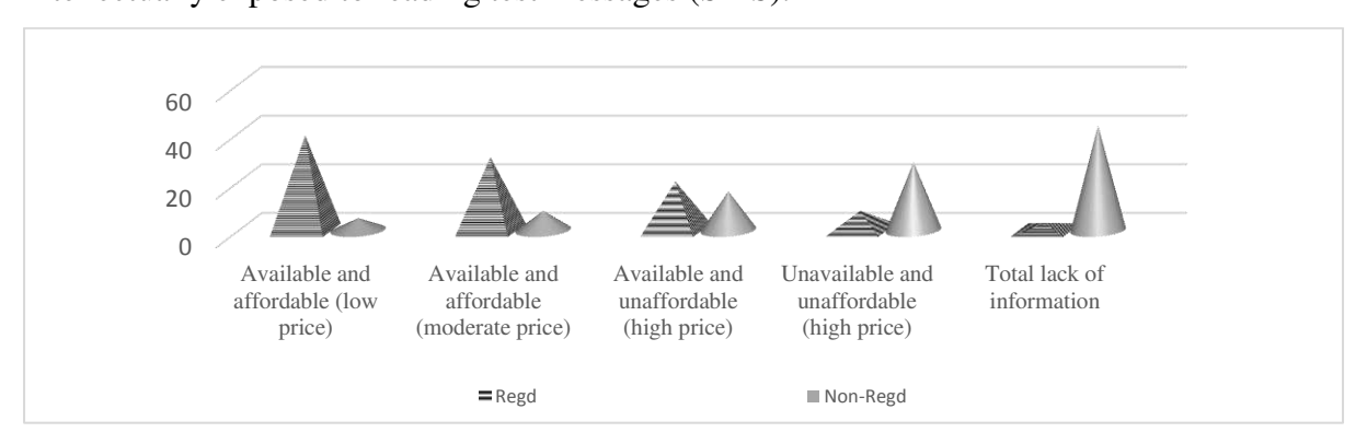
Figure 3. Distribution of respondents by constraints faced in accessing market Information/Input.

From Figure 2, we noted that the usage of the GESS by registered farmers has enhanced the timeliness and access to market information. After the introduction of the GESS, 38% of the registered farmers get timely access to market information, whereas only 8% of the non-registered farmers have timely access to such information. Those who moderately access food market information on time have also increased by 15%, whereas only 6% of registered farmers were still out of the picture. This discovery is consistent with Haile et al (2016) in that the role of innovation in rural farming by promoting the application of ICTs for value chain development is vital. Those who were registered but still without adequate market information were mainly the ones that have limited access to phone and/ or were not intellectually exposed to reading test messages (SMS).