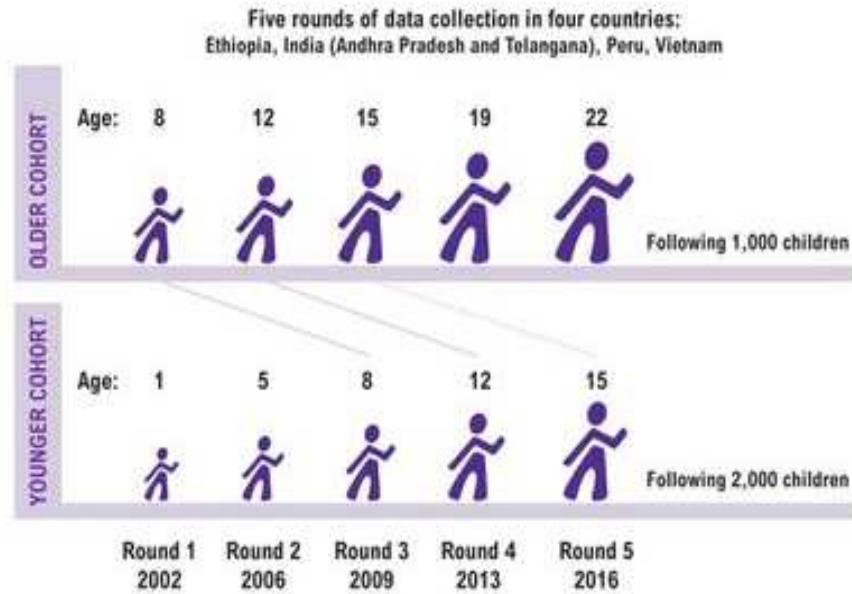
Figure 2: Five rounds of YL investigation in Vietnam