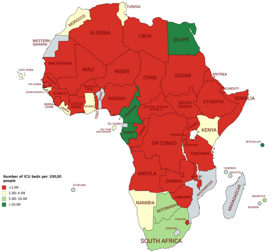
Figure 2: Number of ICU beds per 100,000 people