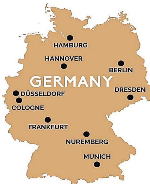
Figure 1: Map of Germany.

Germany is a democratic, federal parliamentary republic (Federal Republic of Germany, Deutschland) led by a Chancellor (the Federal President), where federal legislative power is divided in the Bundestag, the parliament of Germany, and the Bundesrat, the representative body of regional states. Its capital and the largest city is Berlin. It is located in the heart of Europe. Its area is 357,580 km 2 consisting of 16 Länder (states) with populations 83,900,473 (Figure 1). It borders Poland and the Czech Republic to the east, Austria and Switzerland to the south, France, Luxembourg, Belgium, and the Netherlands to the west and the North Sea, the Baltic Sea, and Denmark to the north. Additionally, it shares maritime borders with Sweden and the UK. It has the largest economy in Europe, the world's 4 th largest economy by nominal GDP, and the 5 th largest by PPP. It follows the civil law tradition with three types of courts: ordinary courts, specialized courts, and constitutional courts [Fulbrook, 2014; Country Profile, 2021]. In 2015, nominal gross domestic product (GDP) of Germany was $3.358 trillion compared with $3.237 trillion (revised) in 2014 with an increase of 3.7% [Perez, 2019].