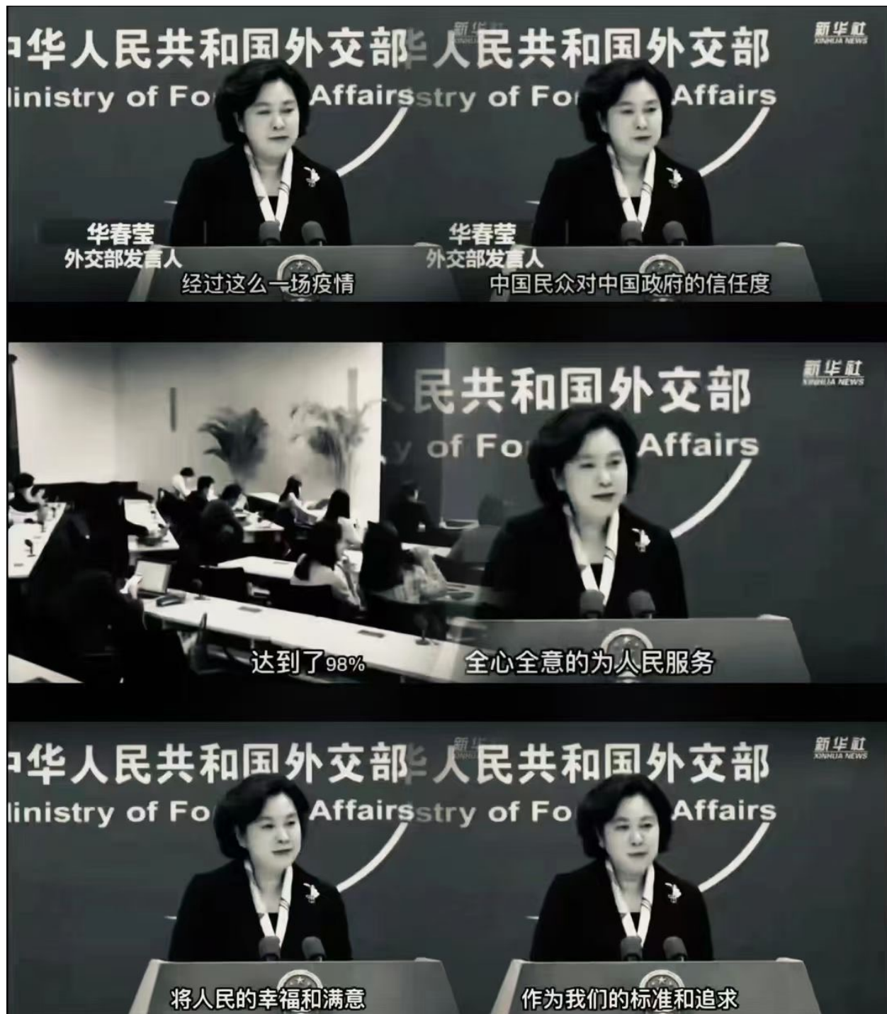
Figure 3 The reversed narratives by PRC Foreign Ministry Spokesperson on population opinions and wills in governmental satisfaction outlet by Xinhua News.

imprisoned by the Chinese authorities for sexual misconduct allegations, where within a half-hour time frame, all major state-controlled media pushed the same news on the imprisonment sentence with large amounts of financial deprivation. Later in the fire with online exchanges of information, mass deletion