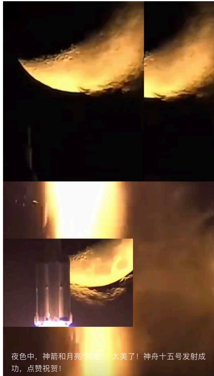
Figure 1 Organized screenshot from the Shenzhou-15 propulsion footage. [4]

Obstructed by the complexities of power dynamics and interests, a mixed methodology between psychological health sampling from the mass neuro-cognitive warfare [11] and biochemical security identification in human security has been adopted, inspired by the Cognitive-Affective-Behavioral model in low-resource context without behavioral intervention in respect of the patients’ autonomy [12,13]. A representative case from psychotherapy is presented on the psychological torture from a massacre and is demonstrative of the mass psychological behaviors. The patient despondently preserved the information on the Nov. 24 th Fire in Xinjiang under the traumatic responses from the details in 2009 [14]. The systematic review dissects public health from politicization agendas with the scientific basis of public health, whereby cases of legal concerns appeared that secret personnels were dressed in medicare uniforms or undercover in residential management committees [15] and confined state authorities, such as a former Highest Court official who advocated for judicial independence and is working on ensuring human rights being respected in the