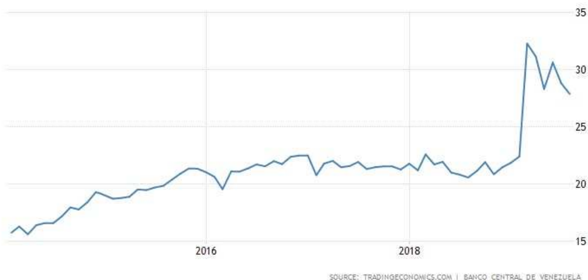
Figure (3): Venezuela Interest Rate

To control the increasing gap between the informal foreign exchange rate premium, the government implemented restrictive monetary regulations on banks to keep bolivars out of the hands of individuals. These policies were designed to drain liquidity and to keep local currency out of the informal market for foreign exchange. This is exactly what proposition (3) implies: to control capital outflow due to economic sanctions it is recommended to control demand for domestic currency. As a result, in August 2018 the benchmark interest rate rose from 23% to 33% in just one month period, and then swung around 30% for the rest of the year 2018 (figure 3). Due to such contractionary monetary policy that aimed at controlling demand for domestic currency, depletion of foreign exchange reserves which is a measure of capital outflow from the country became relatively more stable in the period after August 2018, as indicated in figure (4).