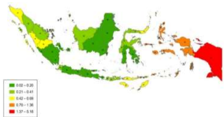
Figure 3. Percentage of agricultural households experiencing food insecurity at a severe level by province

Agricultural households experiencing food insecurity either moderately or severely are characterized by small-scale farms, having higher members of households, relying more on agricultural activities for their livelihood, lower education attainment of household heads, and being led by female farmers (Table 4). These characteristics will anticipate the results of the MLR model estimation that an agricultural household with those characteristics is more likely to experience food insecurity either moderately or severely. Interestingly, the percentage of agricultural households led by younger heads of household, which are experiencing food insecurity either moderately or severely, is lower than those led by older household heads. It is anticipated that the age of agricultural households will have a negative impact on the likelihood of the household experiencing food insecurity either moderately or severely.