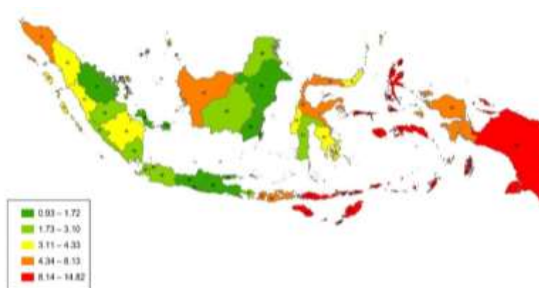
Figure 2. Percentage of agricultural households experiencing food insecurity at moderate to severe levels by province

The estimation results of the Rasch Model pointed out that the proportion of agricultural households experiencing food insecurity at moderate to severe levels was about 3.27 per cent in 2021, while those facing a severe level of food insecurity made up only around 0.29 per cent of the total agricultural households. The probability of agricultural households in Jawa experiencing food insecurity either moderately or severely is lower than agricultural households outside Jawa. It seems that the food insecurity accidents outside Jawa are the Eastern part of Indonesia's phenomenon. The eastern part of Indonesia, particularly Maluku, Papua, and Nusa Tenggara Timur has the highest percentage of agricultural households experiencing food insecurity either moderately or severely (Figures 2 and 3). It is consistent with the fact that those provinces are lagging behind other provinces in Indonesia in terms of socio-economic development.