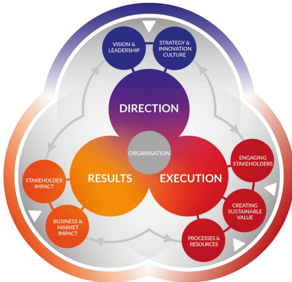
Figure 1: EFQM Model 2020 – Innovation lens, https://efqm.org/efqm-lens-series/innovation/