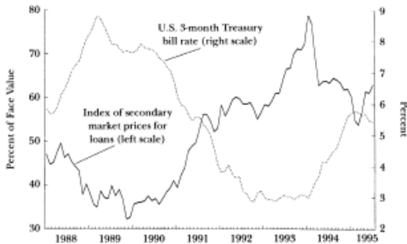
Figure 2 Secondary Market Prices for Loans and U.S. Interest Rate

Note: Index is an average of bid and offer prices for Argentina, Brazil, Chile and Mexico. Sources: Salomon Brothers, Inc., ANZ Bank Secondary Market Price Report and International Financial Statistics, IMF.