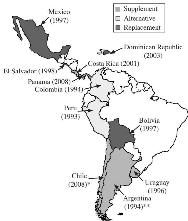
FIGURE 1. INTRODUCTION OF INDIVIDUAL RETIREMENT ACCOUNTS (IRAs) IN LATIN AMERICA, RELATIONSHIP OF IRAs TO EXISTING SYSTEM