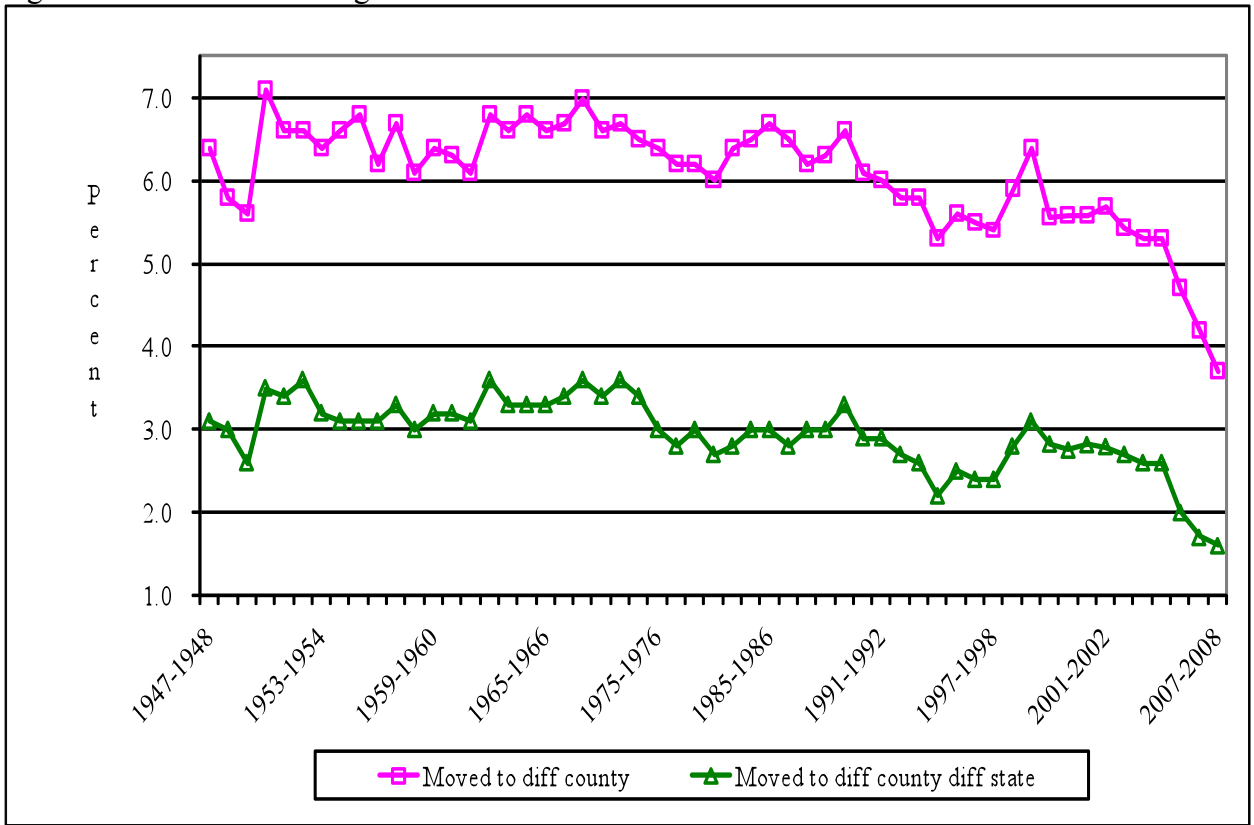
Figure 1. Annual Gross Migration Rates: 1947-2008.

Source: U.S. Census Bureau, Current Population Survey, Table A-1. Annual Geographical Mobility Rates, By Type of Movement: 1947-2009, available at: http://www.census.gov/population/socdemo/migration/tab-a-1.pdf (accessed Sept. 13, 2010).