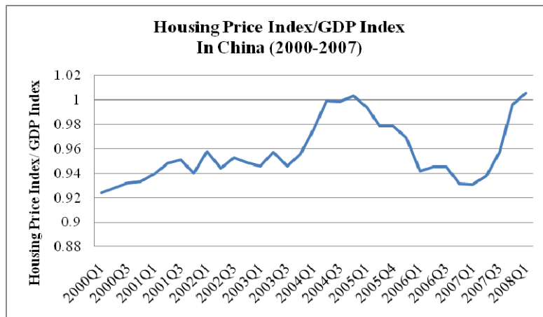
Figure 2. Housing Price Index/ GDP Index in China from 2000 to 2007