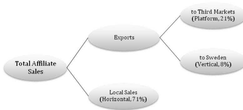
Figure 2: SALE COMPOSITION OF SWEDISH MNEs: ALL NEWLY ESTABLISHED AFFILIATES, 1987-1998

back to the parent country or elsewhere. These can be called vertical and export platform FDI, respectively. In this paper, I take this difference into account.