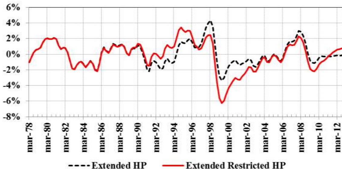
Figure 2. Extended and Restricted Extended Estimates of the Colombian Output Gap

The restriction over the cycle in 2011 has an important effect on the estimated filter. The extended filter reaches zero more slowly than the extended restricted version, and remains close to zero for an extended period of time. Moreover, the extended restricted version of the filter has a high slope at the end of the sample showing the creation of inflationary pressures for the near future.