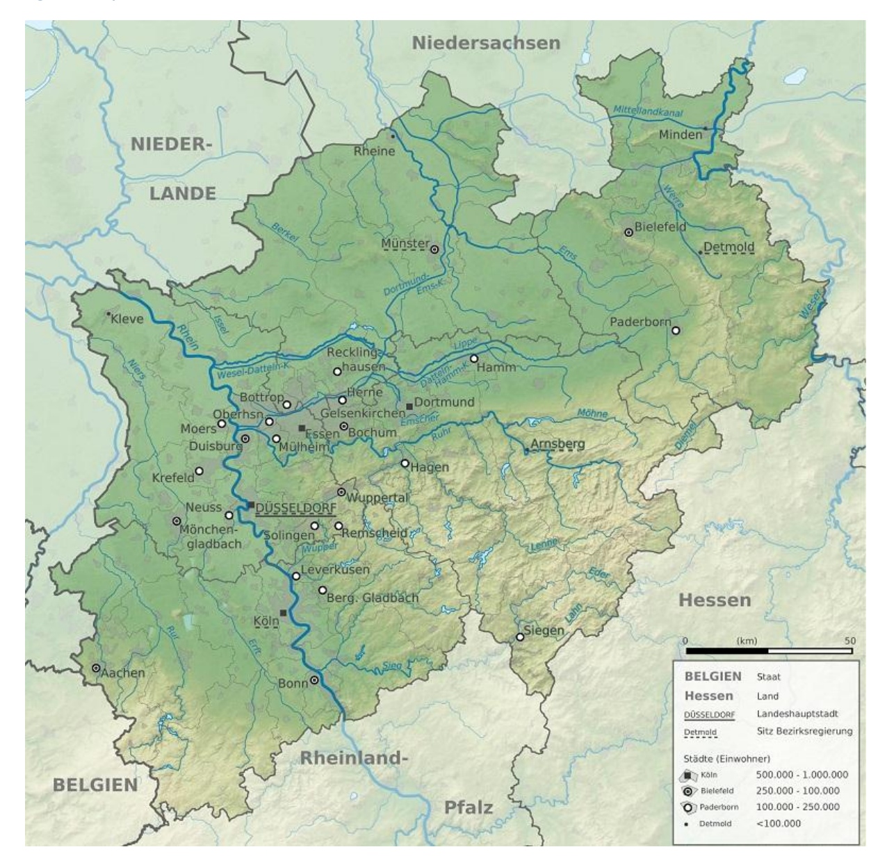
Figure 1: Map of NRW