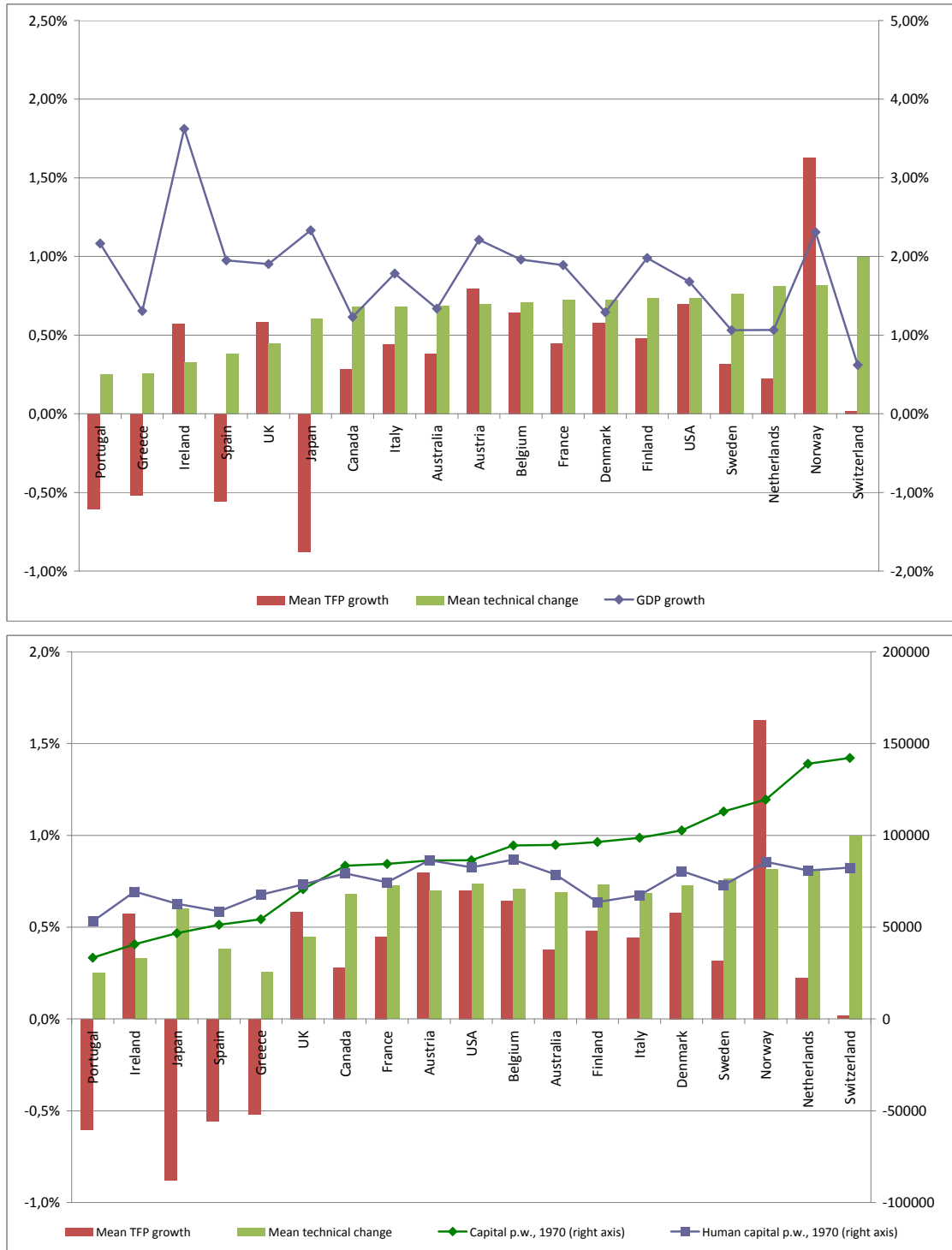
Figure 1: Means over TFP growth indexes and technical change measures, and their relation to growth in output per worker and initial physical and human capital stocks.