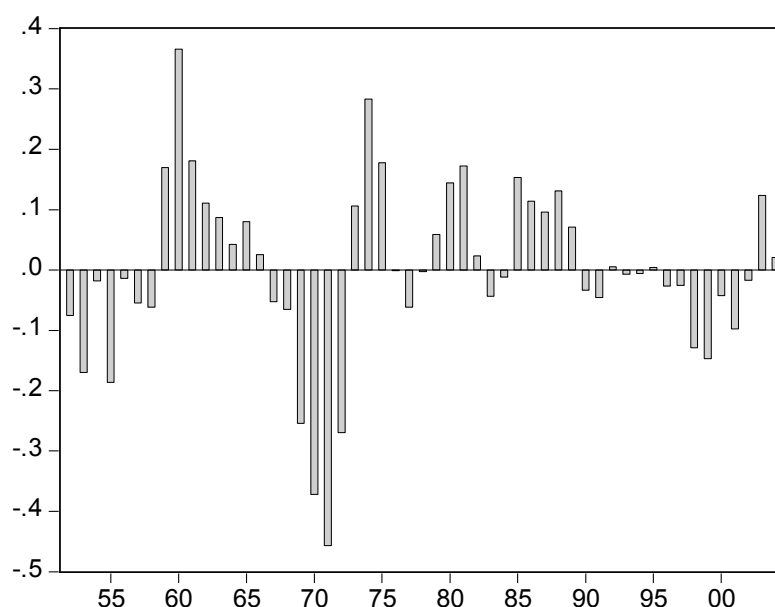
Figure 2. A residual from a cointegration equation in the BEER model (1952-2004)