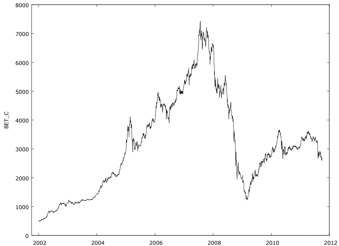
Figure 1 - Evolution of BET-C from January 2002 to September 2011

We calculate the returns of the BET-C index, using the formula: