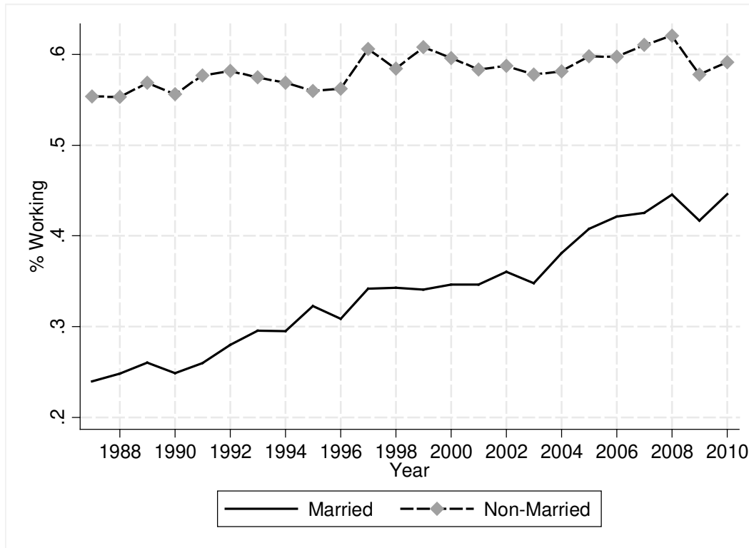
Figure 1. The female labour supply in Mexico.

Notes: Calculations were made by the authors, using Employment surveys in Mexico for females aged 20-60 years old. We use the surveys Encuesta Nacional de Empleo Urbano (ENEU), Encuesta Nacional de Empleo (ENE) and Encuesta Nacional de Ocupacion y Empleo (ENOE). To compare all of the surveys, we restrict the information to urban areas (i.e., areas with more than 100,000 people). The surveys are available at http://www.inegi.org.mx .