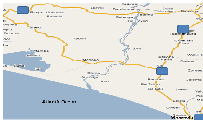
Figure 1: Map showing locations of the three towns, Tubmanburg, Kle and Senjie